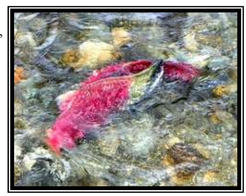
Sockeye Salmon

spawn in their natal (home) spawning beds. Migrating salmon change morphologically once they reach fresh water, and do not feed. They enter the fresh water, and up to 90 days later, after expending incredible energy to navigate our rivers and streams, reach their spawning beds. The health of the water is paramount to their survival - too warm and the salmon will not make it to their destination. Fish burn up their fat reserves if they are stressed with warm water, which may result in death or an increase in parasite load. Water must be cool and clear, with sufficient dissolved oxygen. Oxygen is critical for survival of eggs, right through to the fry stage. Fine sediment deposits in gravel or other habitat, depletes available oxygen. Increased organic matter, resulting from pollution, will also deplete oxygen. Water velocity must be maintained to wash away waste, especially on spawning grounds. PH is an important factor in the health of the salmon population. Coarse woody debris and cover along stream banks allow shading, gives protection from predators, and provides resting areas. Gravel on spawning beds must be the correct