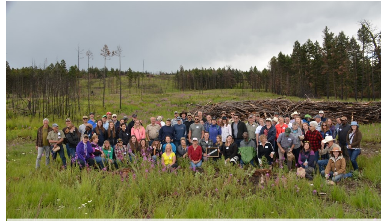
Picture of all the tour participants at the PNW SRM Summer Tour 2019 in Cache Creek, BC.